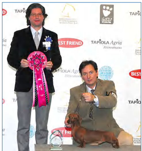
● Group 4 winner was Miniature Smooth-haired Dachshund, Am Ca Ch Grandgables Carpaccio In Red, owned by Dimitria Antonopoulos from Sweden.